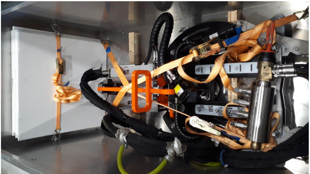
Figure 5-1 Transport

Make sure that the saw is properly strapped in the transport box, example of how to do this is shown in the picture below: